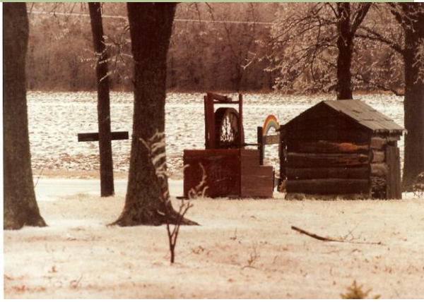
Old Mill at Pearson's Mill/Rainbow