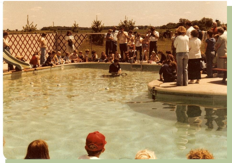
Baptisms at Old Swimming Pool